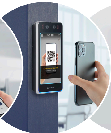
QR and Barcode